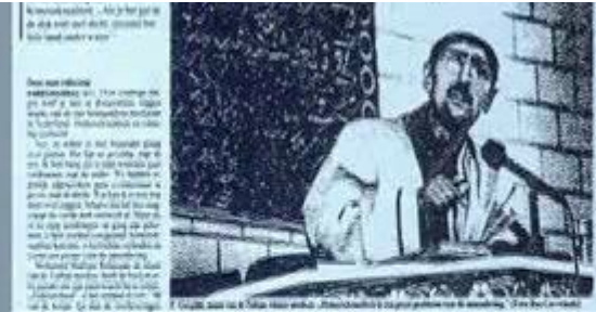
Imams don't like gays